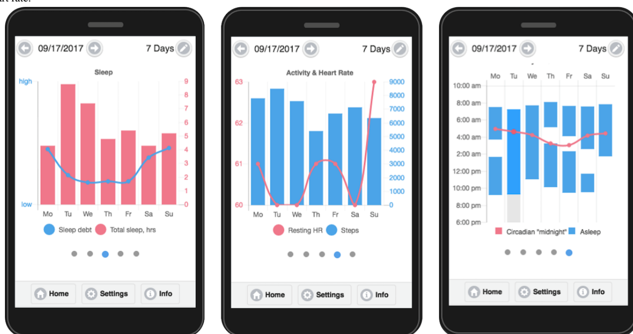
Figure 2. Screenshots of Visualize portion of study app showing data collected from Fitbit and variables computed from mathematical modeling. HR: heart rate.